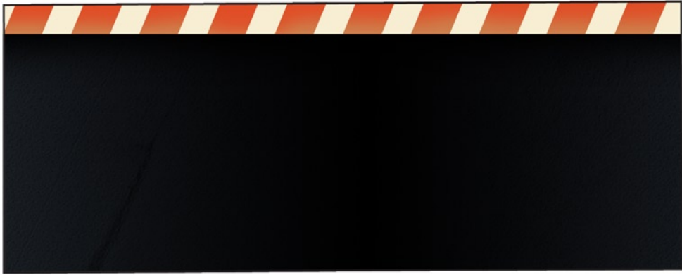
★ Extender Piece ★